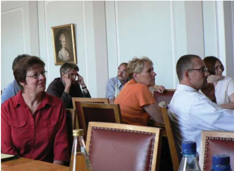
Hessen-Wisconsin Teacher Seminar, Darmstadt 2005